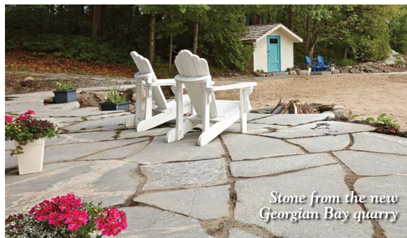
Stone from the new Georgian Bay quarry

With the precise calibration produced by the giant Python saw at Muskoka Rock, there are no boundaries for the imagination in the use of stone. With its unique veining and pigments, stone flooring adds the textures of nature to a room, making traditional tiled and wooden floors seem somewhat bland in contrast. And beyond floors and patios, granite elements can give